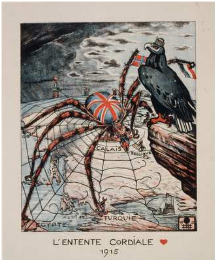
The Cordial Entente