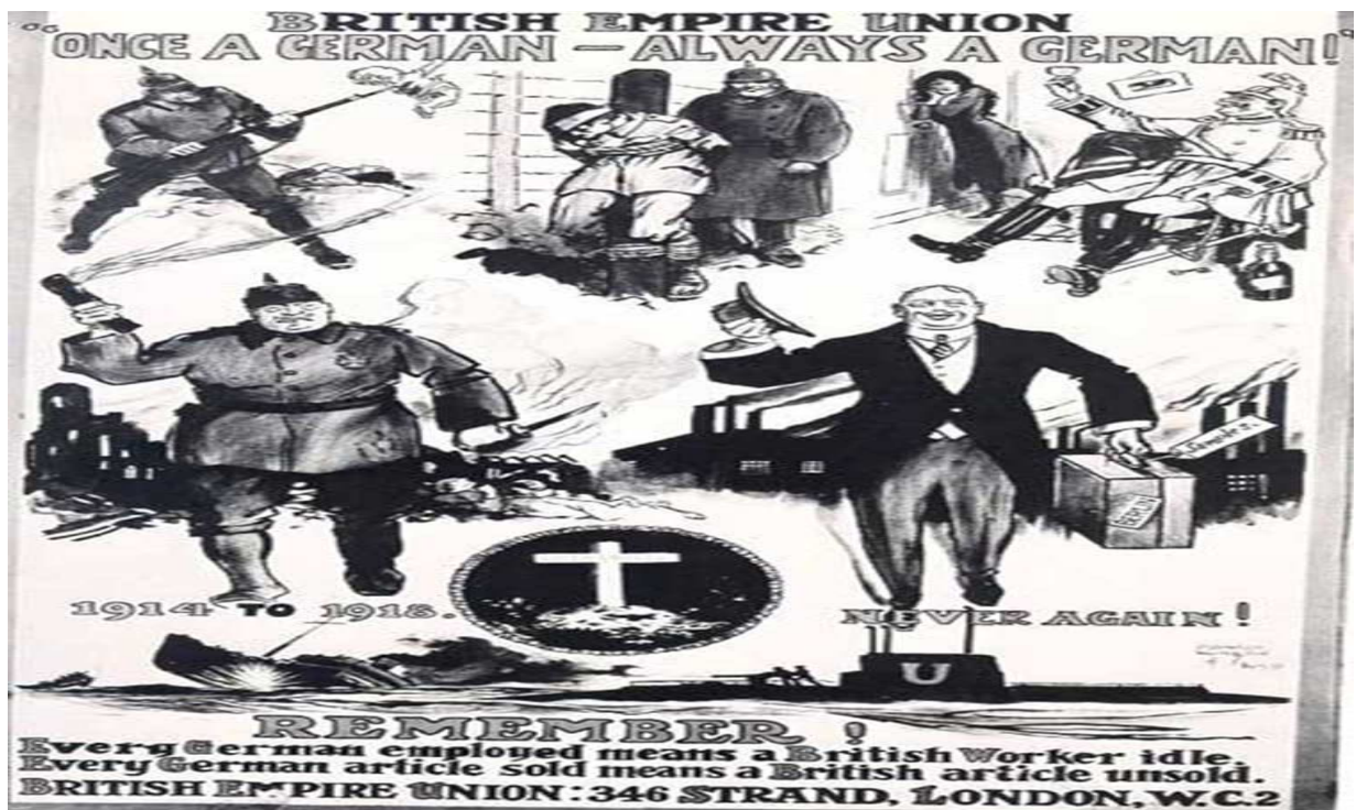
British Empire Union Once A German- Always a German!