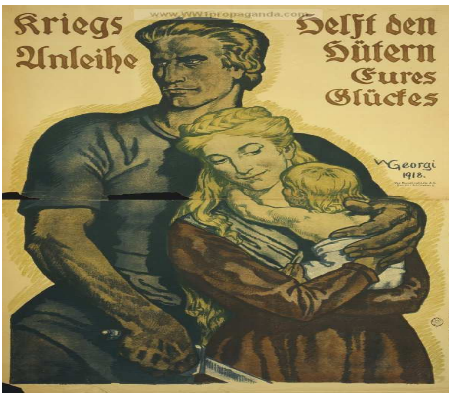
War loans help the guardians of your happiness.