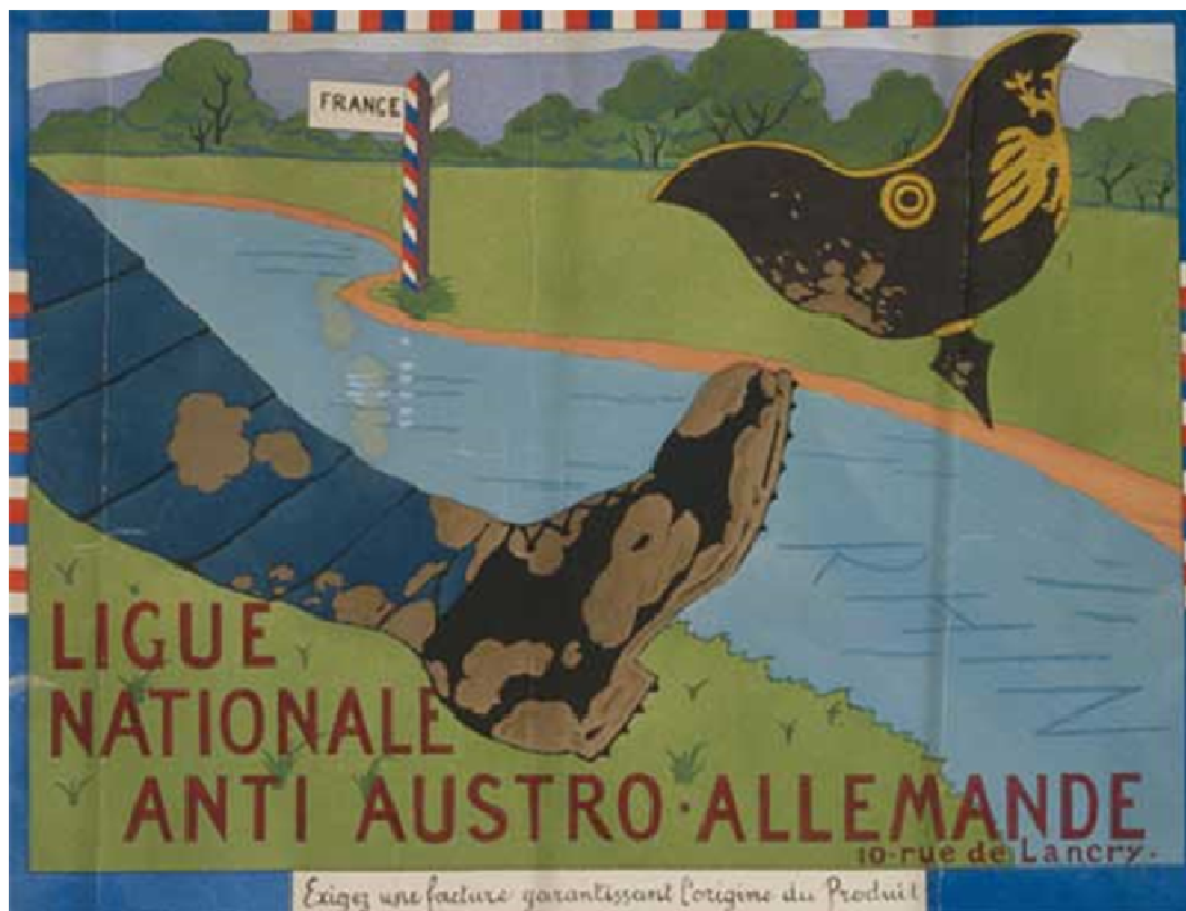
National Anti-Austrian and German League!