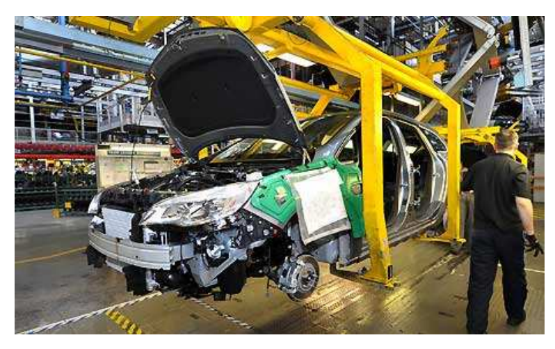
What is Industry?